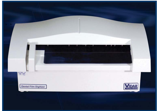
VIDAR's Dental Film Digitizer